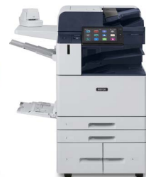
Xerox® AltaLink® B8145/B8155/ B8170 Multifunction Printer

To learn more about Xerox® ConnectKey Technology, go to www.ConnectKey.com .