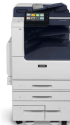
Xerox® VersaLink® B7125/B7130/ B7135 Multifunction Printer