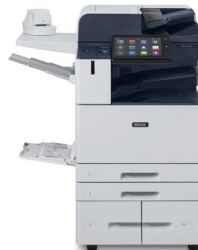
Xerox® AltaLink® C8130/C8135/ C8145/C8155/ C8170 Color Multifunction Printer