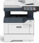
Xerox® VersaLink® B415 Multifunction Printer