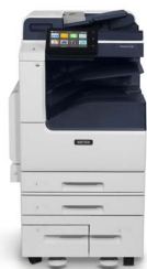
Xerox® VersaLink® C7120/C7125/C7130 Color Multifunction Printer