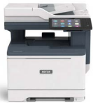
Xerox® VersaLink® C415 Color Multifunction Printer